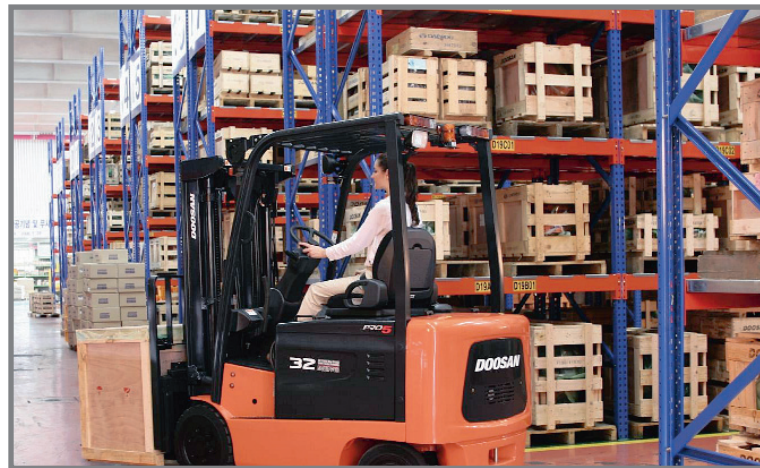
Above and left: GLTC KZN is currently the market leader in warehousing solutions in KZN, with some of the most famous brands in the industry including Crown, Doosan and Bendi.

demands of warehousing, Crown has equipment to suit every conceivable warehouse application.